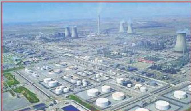
SASOL's Secunda CTL Plant Operation in South Africa